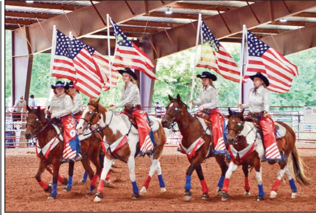
Sass 'n Saddles Precision Drill Team members showed off their horseback riding and choreography skills over the two nights of the Blairsville Pro Rodeo.