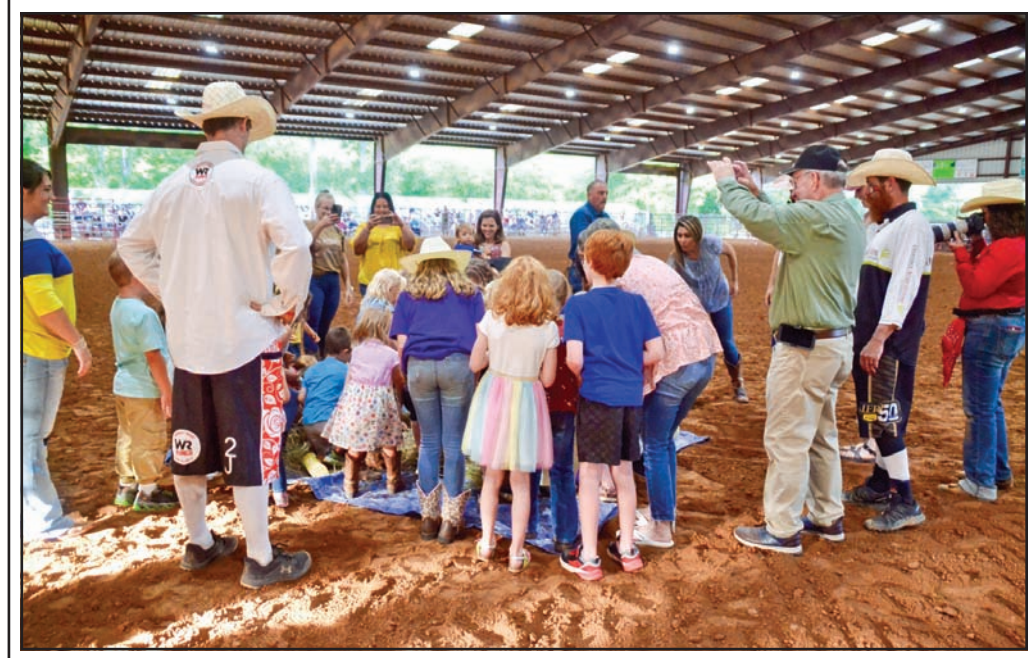
Families are what the Blairsville Pro Rodeo is all about, and children were given plenty of opportunities to participate in the event June 17-18.