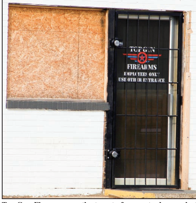
Top Gun Firearms was the target of property damage last week, though nothing was taken from the store, according to the Blairsville Police Department.