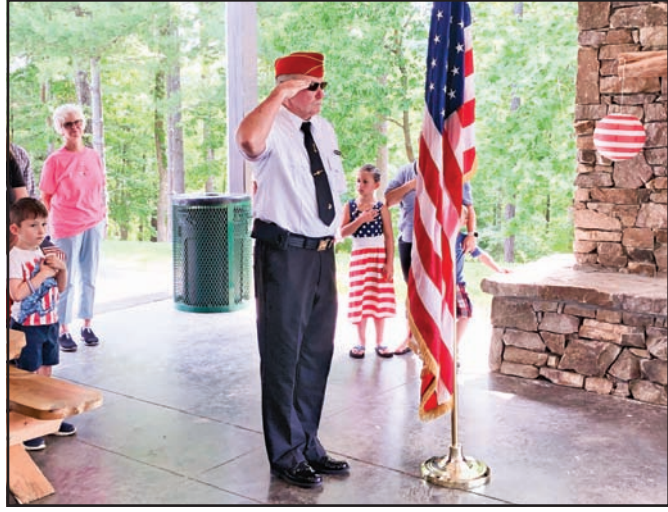
A member of the North Georgia Honor Guard salutes the American flag during the June 14 celebration of Flag Day by the Union County GOP.

"Yes, there's a few issues going around that everybody doesn't agree with everything, but overall, it's a great country, a great community, a great county, and we appreciate what