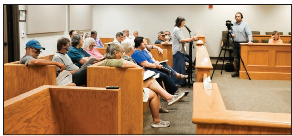
The Union County Commission meetings continue to be well attended each third Thursday of the month at 6 p.m. inside the courthouse.